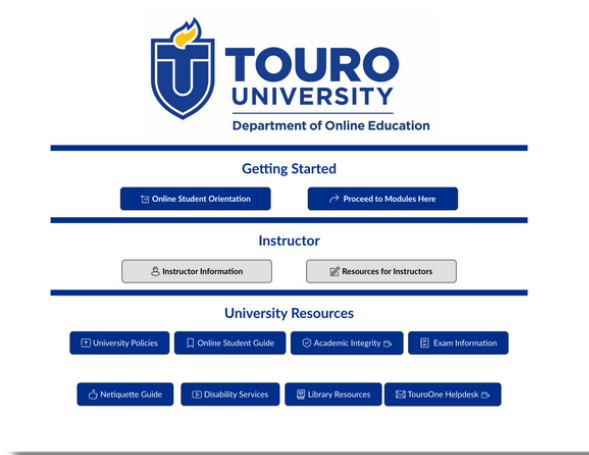
The Touro Course Home Page in Canvas